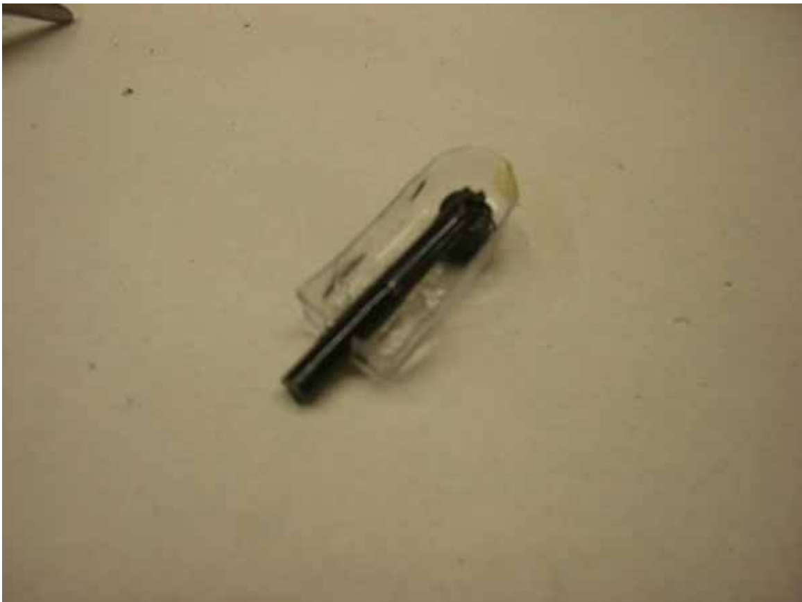
Tail Wheel assembly

The tail wheel assembly consists of a molded black plastic piece, A wire gear strut and the wheel. Glue it together as in the picture. Make a small hole in the back of the tail section to glue the assembly into.